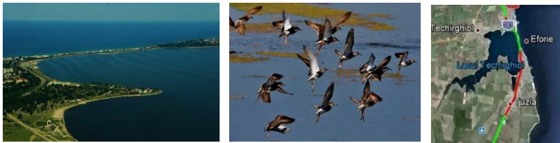
Figure 1. Images with the Techirghiol Lake

The lake's Techirghiol salinity measured in 1936 was 99.6 g/l, in 1996-81.485 g/l, 2004– 65.1 g/l, and in 2010 was below 60 g/l, which proves the cumulative effects of the natural fluctuations, but also, the environmental problems. Due to the almost permanent wind, which constantly mixes the lake's waters, the lake rarely freezes (especially in the middle area). This water characteristic, remaining unfrozen even if the air temperature gets to -2 0 C or -3 0 C during winter, makes this place so attractive to numerous wintering waders (Figure 1).