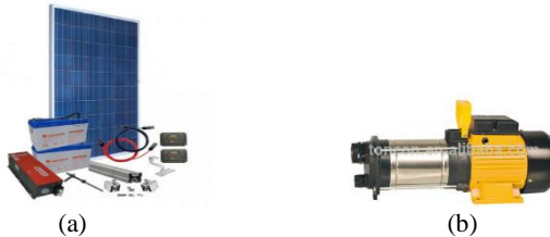
Figure 3. Prototype components

The main advantage of this system is its small weight. The system components are an Off-Grid of 1 kW with energy storage in batteries. The package contains two 500 W panels, an inverter 24V/UPS system 1000 with Controller 60 A 12-24V EP Solar, plus accessories. The modules are reliable photovoltaic panels, with great efficiency and high yield. Even with a reduced incidence of light, the module achieves a good performance and yield. Before and after lamination, each module undergoes an electroluminescence test.